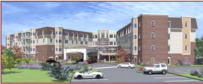
Architect rendering of the Keystone Villa At Ephrata