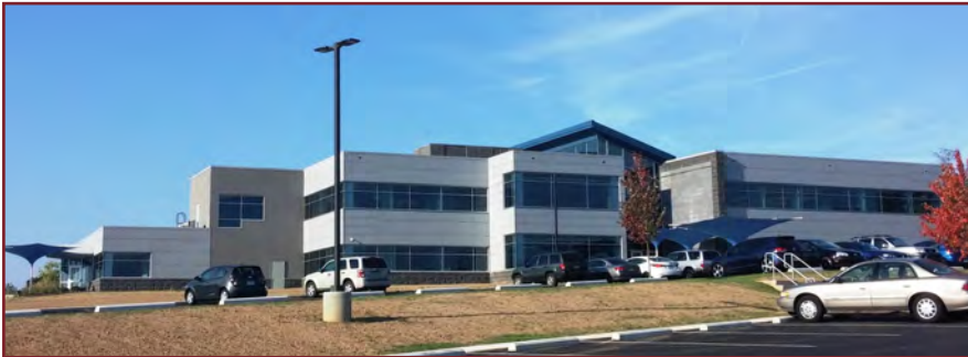
Gateway Ticketing Systems, Inc. Global Headquarters.