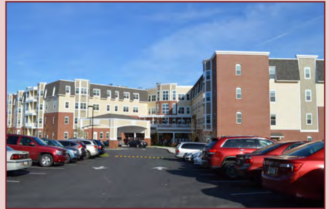
Keystone Villa At Ephrata 100 N. State Street, Ephrata, PA 17522